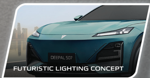
FUTURISTIC LIGHTING CONCEPT

Rise above the ordinary. Born to outstand, the DEEPAL S07 is a fearless e-SUV, built to push beyond limits.