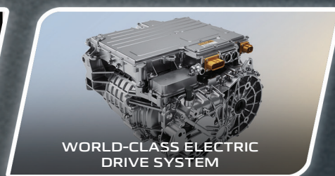
WORLD-CLASS ELECTRIC DRIVE SYSTEM

Where luxury meets spaciousness, Yacht-inspired gives an elegant touch in every detail.